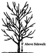
Figure 3: Select the lowest permanent scaffold branches