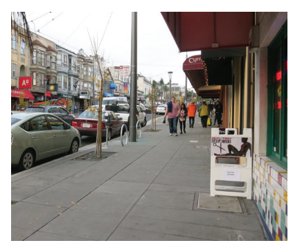
New Sidewalks will provide a safe and comfortable shopping experience for pedestrians, and will remedy the steep cross-slope near Cal-Mart and Starbucks.

Heritage Olive Trees are proposed to be planted along the south side of California Street. Standard olive trees will be planted on the north side.