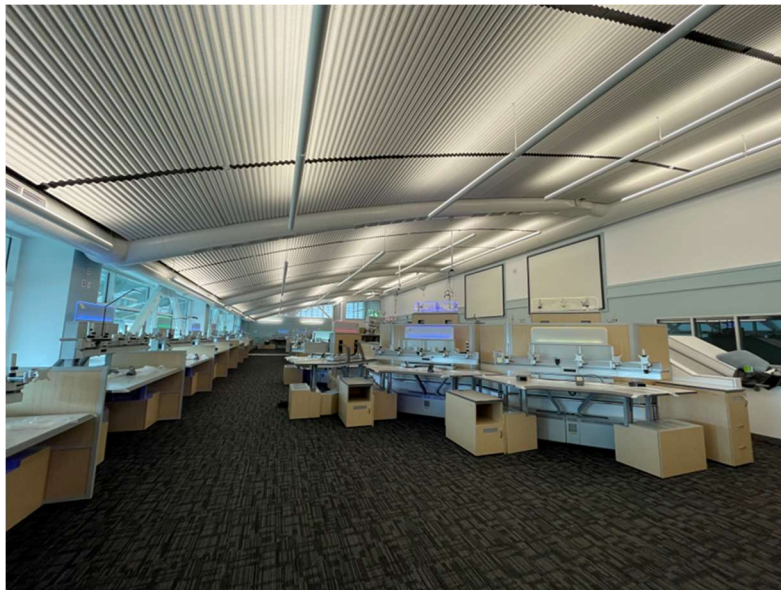
911 Call Center construction at the City's Emergency Operations Center