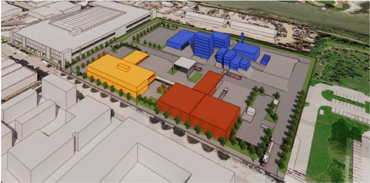
90% Concept Design (as of 1/22/24)